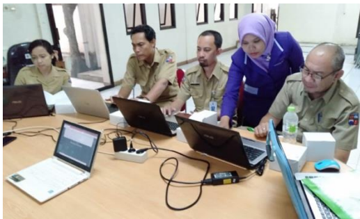
Figure 1. Assistance Training of Ciwaringin Website

Training activities and assistance for village officials are conducted to train the village officials in managing email, google drives and the web as e-Government. Training activities can be seen in Figure 1. Mentoring and training is more specifically on the back-end page. One of the activities in the training is that village officials are asked to fill in a new admin according to their respective username and password. The results of adding admin data are shown in Figure 2. The next is the activity data update in the Village office and the use of other menus in accordance with the material for each meeting.